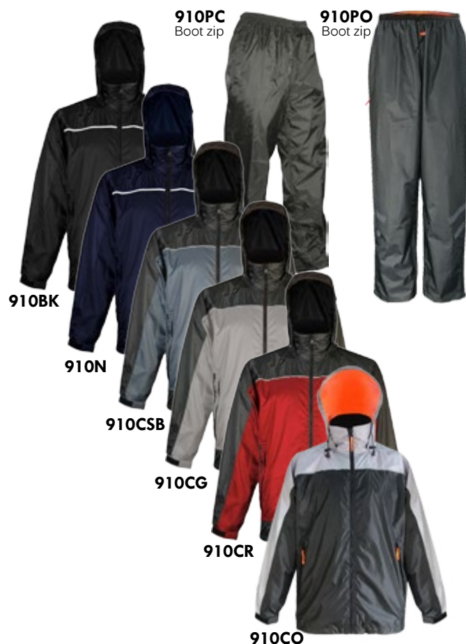
910PC Boot zip