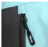
Waterproof coil zipper

All Viking® garments use tooth zippers on front and boot closures