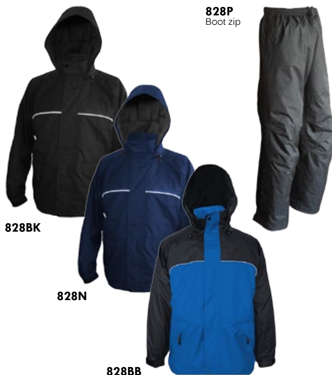
828P Boot zip